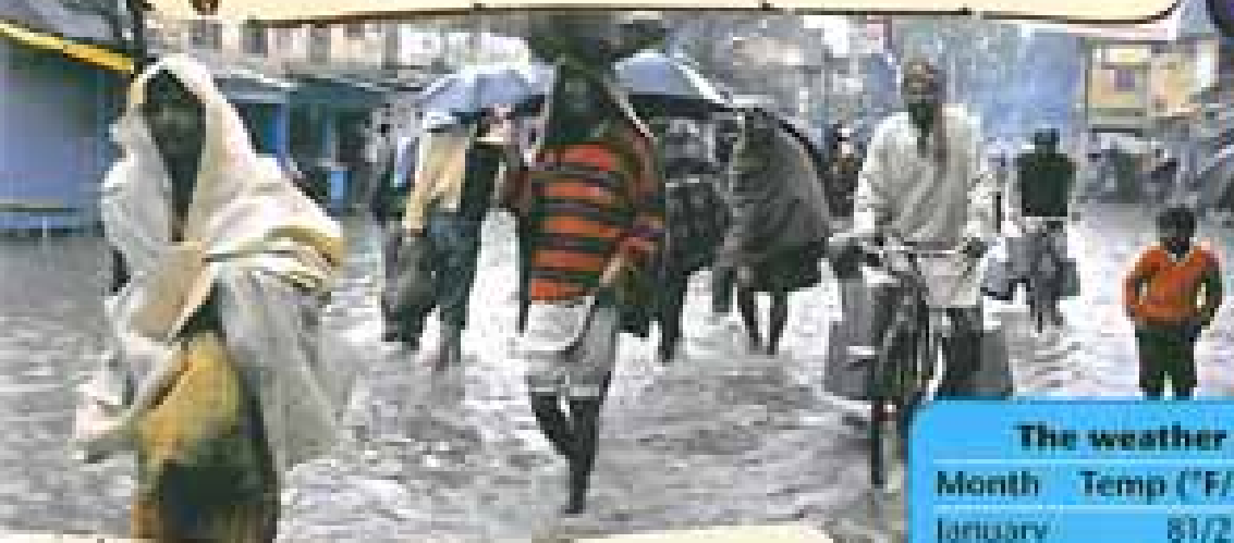
The weather in Mumbai

India has many different kinds of weather, but the monsoon affects the whole country. This brings high temperatures and lots of rain.