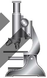
◀ Skin seen under a microscope, magnified 265 times (left) and 1,330 times (right)