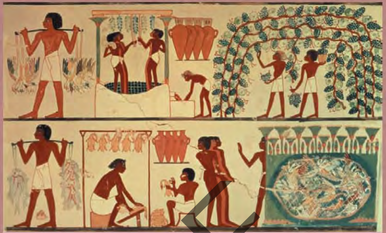
This painting shows an Egyptian fishing scene.

Wall paintings in tombs show ancient Egyptians fishing with rods, nets, and spears. The ancient Greeks and Romans made flies of colorful feathers to attract fish. There are two kinds of modern fishing: commercial and sport. Sport fishing uses the same basic tools and techniques as early anglers. People make flies out of feathers and fish with rods, spears, and nets. One big difference between past and present is the popularity of catch-and-release