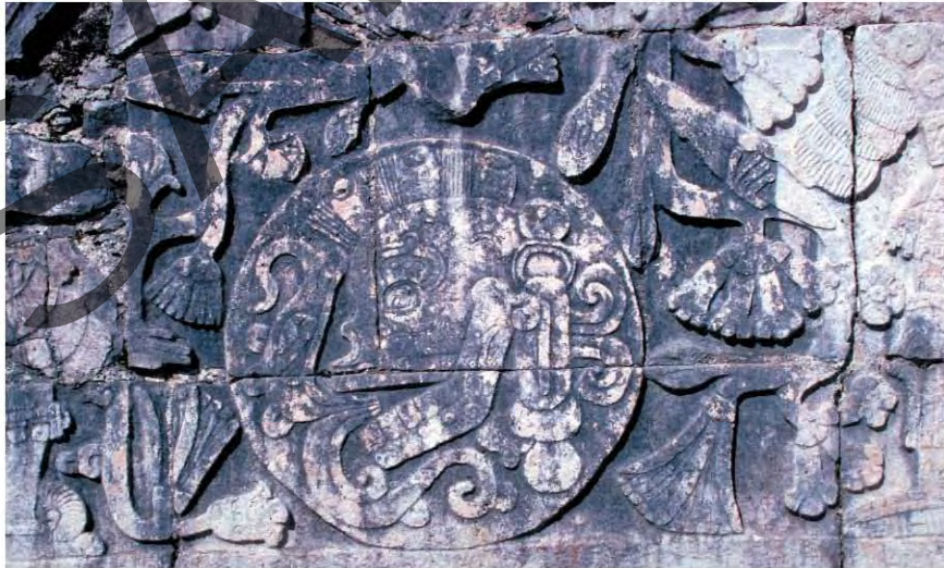
Ceremonial skull ball detail from Chichen Itza