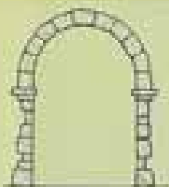
1066–1180 Norman arch