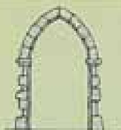
1180–1275 Early English arch

?3 What do these different arches tell you about how long it took to build a big church like this? Count the pointed arches on each level. Can you tell how long this wall took to build?