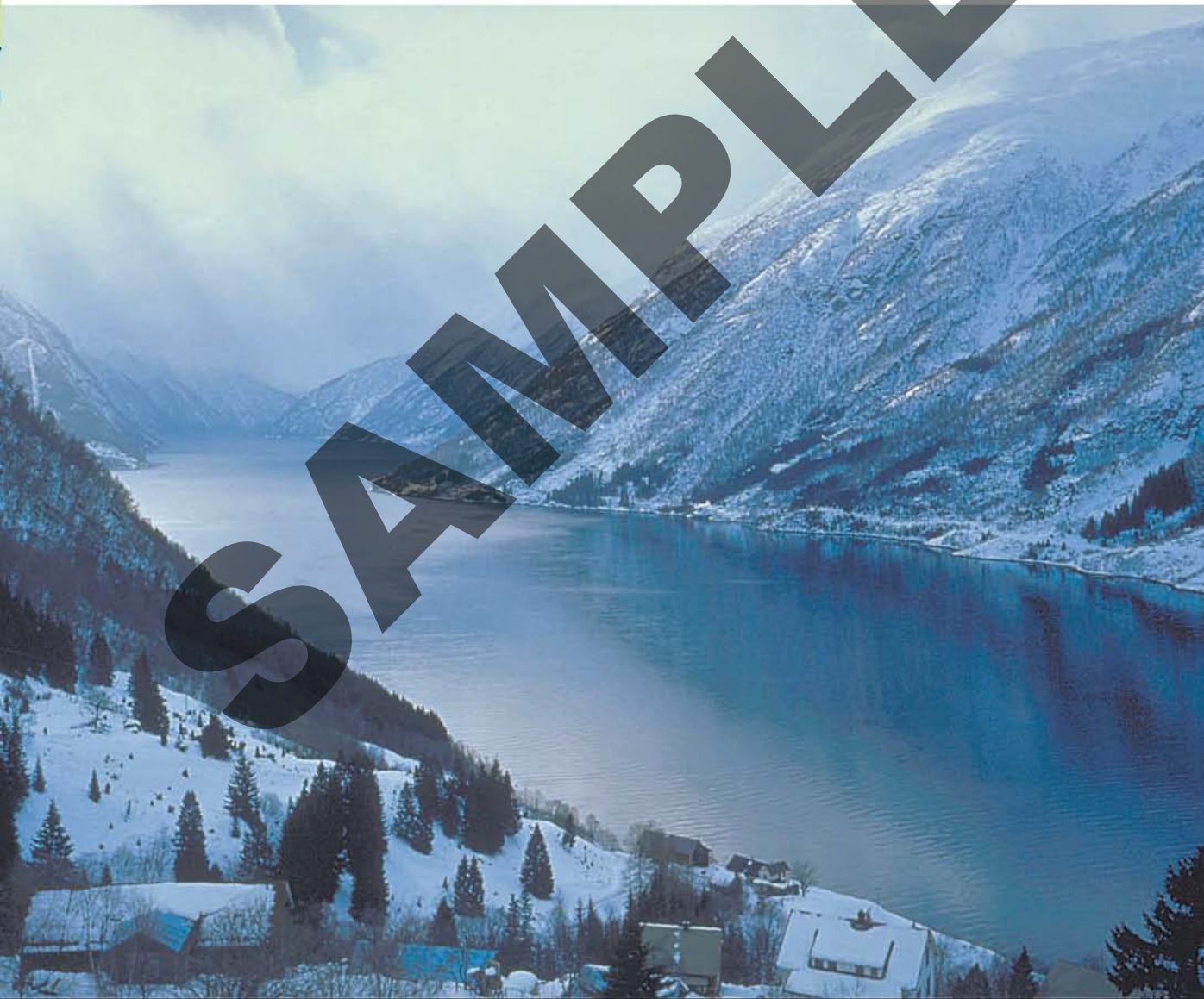
A fjord in Norway

The Vikings discovered new lands, built cities, and invaded foreign countries. They carried their skills, ideas, and language wherever they settled. Traces of Viking civilization can still be found in many European lands.