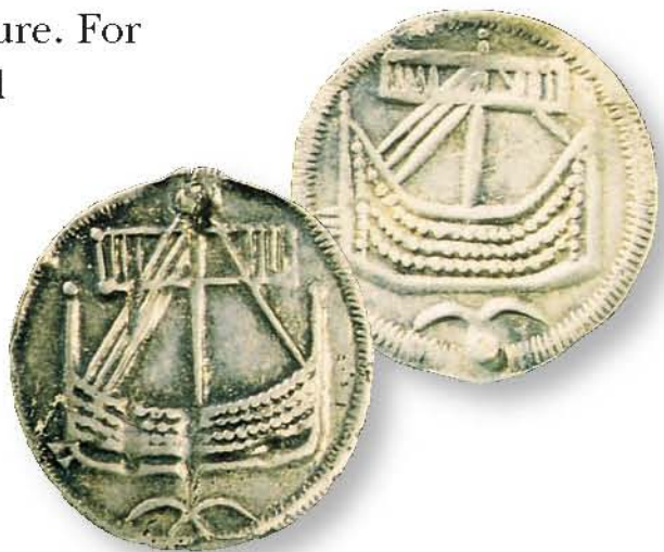
▼ Viking ships shown on Viking coins