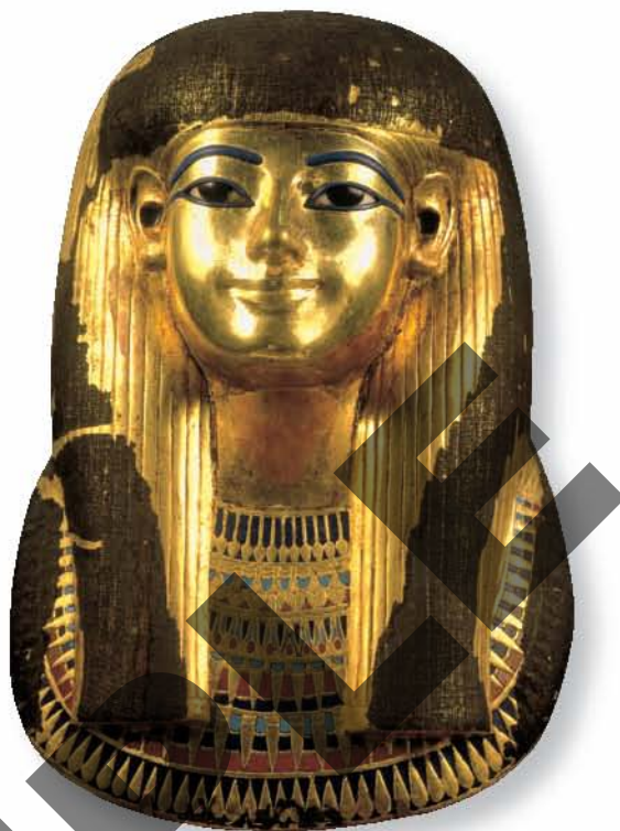
An Egyptian mummy mask

Dead bodies were often put in special places, such as caves, graves, tombs , or burial chambers . Sometimes, bodies were placed together in cemeteries.