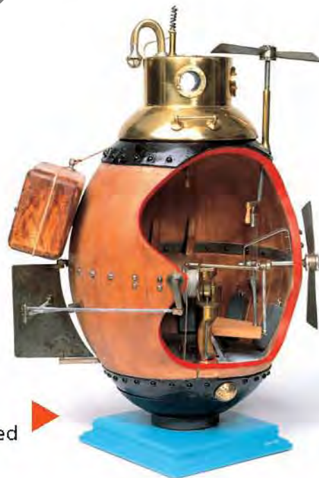
This one-person submarine, called the Turtle , was invented by David Bushnell in 1776.